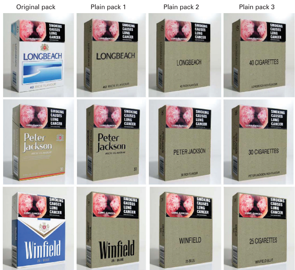
Figure 1 Original and plain packs for each brand.

perceived sensory attributes. 29, 30 In the current study, respondents were asked to rate the cigarette pack they were shown in relation to: brand image (the mental associations that are stimulated by the pack's appearance alone); smoker attributions (anticipated personality/character type of the typical person who might be expected to regularly smoke the pack displayed); and inferred smoking experience (the type of smoking experience which might be anticipated from a cigarette contained in the displayed pack).